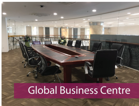
Global Business Centre