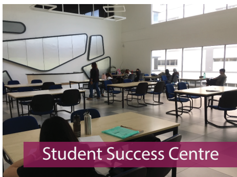
Student Success Centre